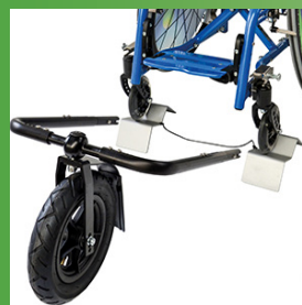
jack up aid

The supplied jack up aid facilitates or enables the independent mounting and dismounting of the outdoor front end.